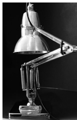
The Anglepoise 1227

He later licensed the design and 1935 saw the release of the familiar household lamp.